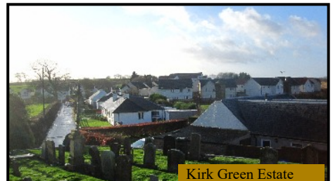
Kirk Green Estate