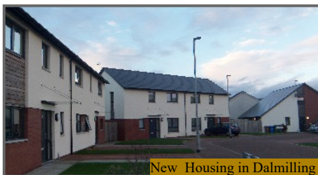
New Housing in Dalmilling