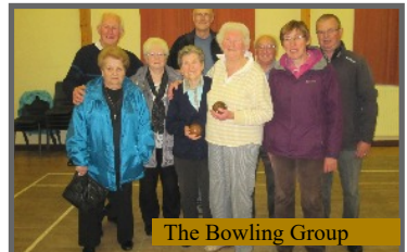
The Bowling Group