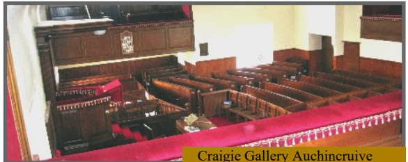
Craigie Gallery Auchincruive