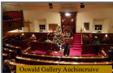
Oswald Gallery Auchincruive