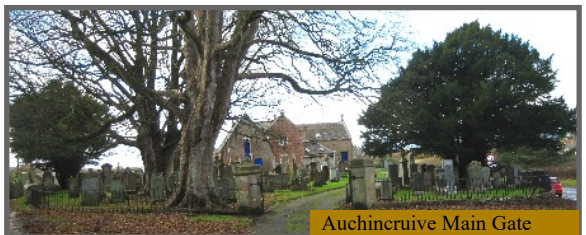
Auchincruive Main Gate