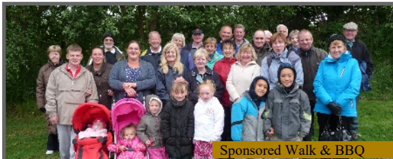
Sponsored Walk & BBQ