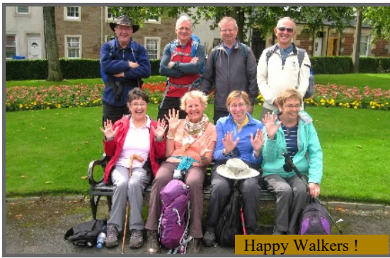
Happy Walkers !