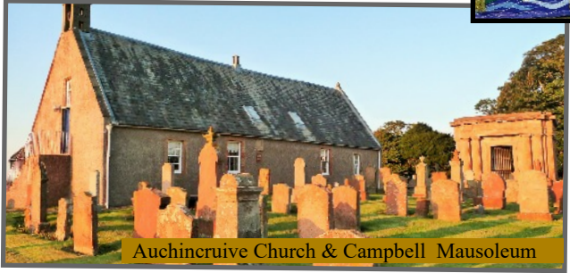
Auchincruive Church & Campbell Mausoleum