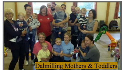
Dalmilling Mothers & Toddlers