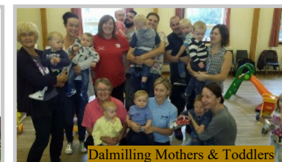
Dalmilling Mothers & Toddlers