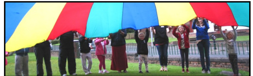
"Ayrthegither" Holiday Club

Last year two community workers were employed by the church's Priority group to work from Dalmilling Church. They initially established a Nearly New shop, a mother and toddler group and a football club and were hoping to develop a coffee shop/IT hub.