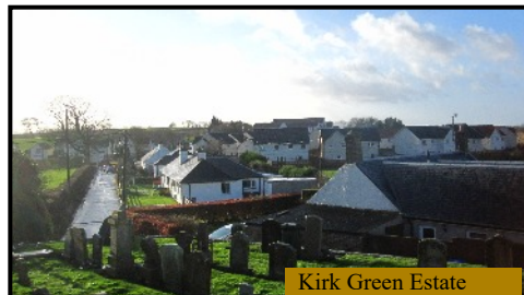
Kirk Green Estate