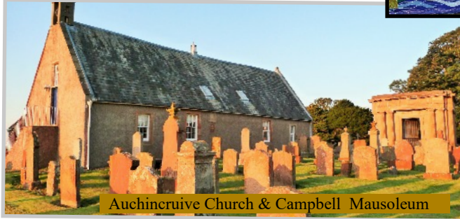
Auchincruive Church & Campbell Mausoleum