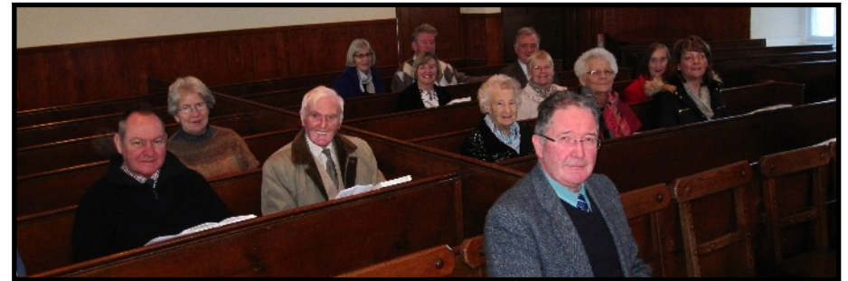
Some members of the Auchincruive Congregation