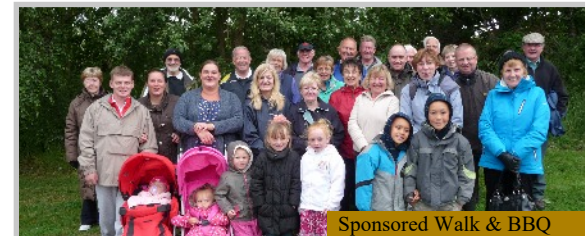
Sponsored Walk & BBQ