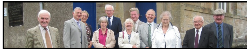
Some of our Kirk Session Members

Our minister has retired after 6 years with us, and we now seek a new minister who will help us to continue and develop our faith. We seek someone who can lead and inspire us to build on our faith in sharing the gospel. A minister who can confirm and revive interest and develop mission in our parish; someone who can challenge whilst being aware of the practical issues. We would welcome a fresh approach to involving the congregation actively in reaching out to young families.