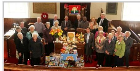
Harvest Thanksgiving Service