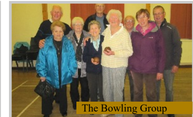
The Bowling Group