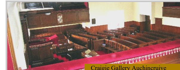
Craigie Gallery Auchincruive