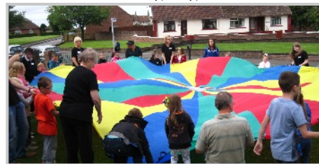
School Holiday Club