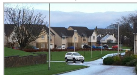
Kirk Green, Auchincruive