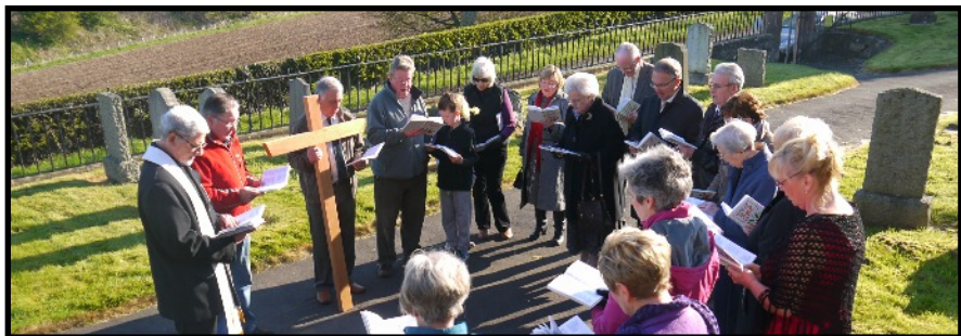
Outdoors early-morning Easter Service

You are someone who can get on with people and will lead us forward on our spiritual journey, someone who our congregation, of all ages and backgrounds, can go to for guidance and comfort in times of trouble.