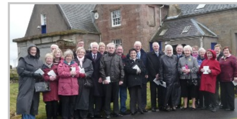
Outdoor Easter Service