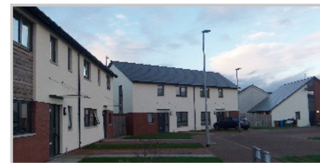
Original and New