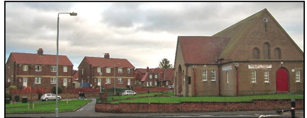
Dalmilling Church and local Housing

Dalmilling is a designated Priority Area and the building was the subject of a Feasibility Study which will dictate future planning. This is on-going and will take the next 6-12 months to complete. Currently there is an ongoing local housing redevelopment / improvement programme in the Dalmilling area.