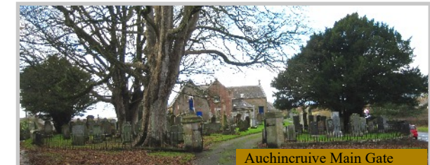
Auchincruive Main Gate