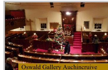
Oswald Gallery Auchincruive