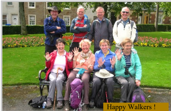
Happy Walkers !